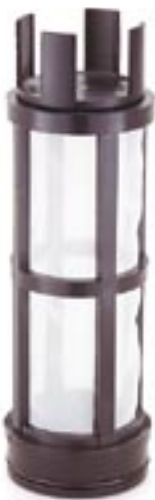
Inlet Very Coarse (150 micron)