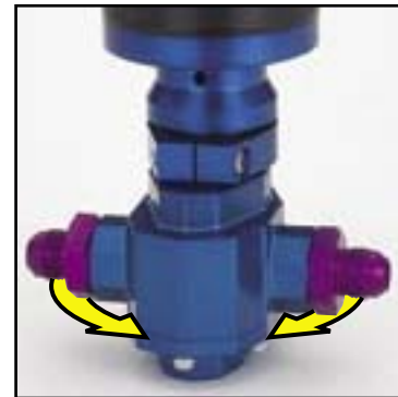
Swivel flange allows you to loosen pinch bolt and swivel the head 360° after the pump is mounted to optimize the fuel line routing.